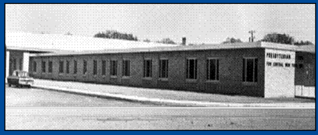
Presbyterian Home for Central New York, 1967

Presbyterian Homes & Services has always had one goal: to give our residents, and the many others who use our services, the opportunity to succeed in their environments: at home, in one of our residences, or during a temporary or long-term stay here. And although we still have "Presbyterian" in our name, we serve all faiths, and have for many years.